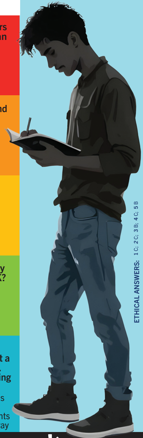
ETHICAL ANSWERS: 1 C; 2 C; 3 B; 4 C; 5 B